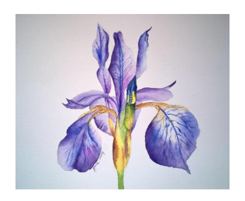
Iris by June Covey